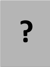
Associate Professor / Professor Tenure-Track / Tenured